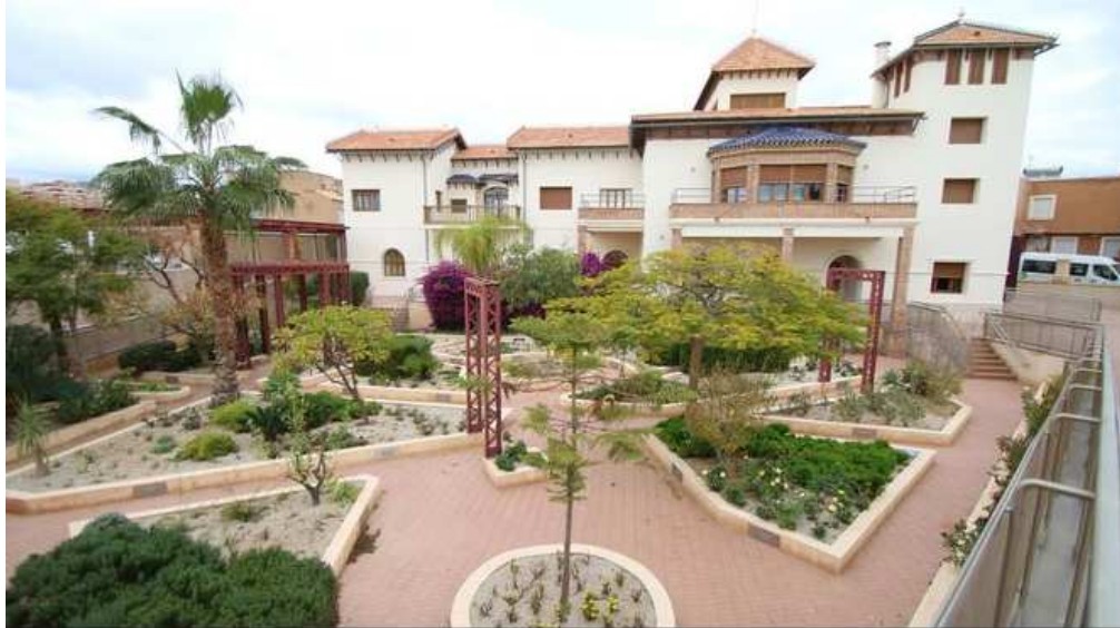
After the improvements